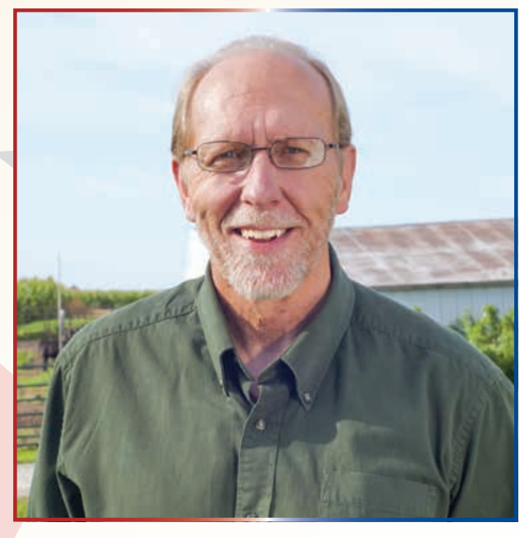
US Congress – CD 2 David Loebsack