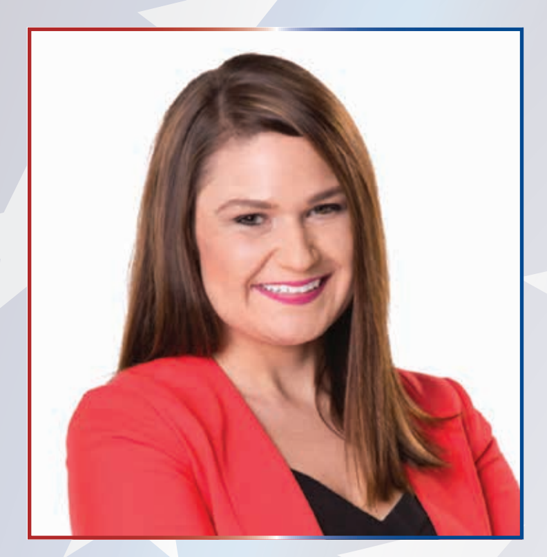
US Congress – CD 1 Abby Finkenauer