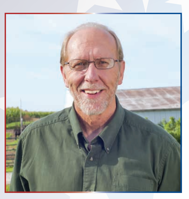
US Congress – CD 2 David Loebsack